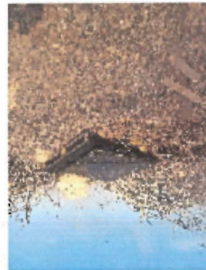
Pallets and Garbage