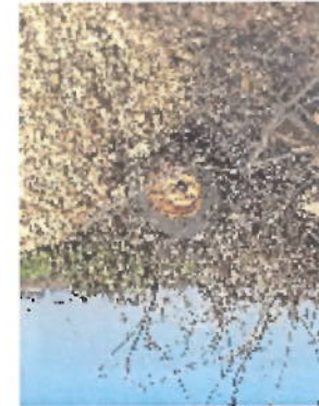
Tires and Rims